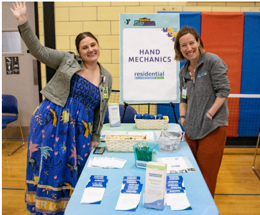
Residential Hospice in Northbrook hosted one of the SeniorPLAYooza activity tables called 'Hand Mechanics' at the North Suburban YMCA in Northbrook.