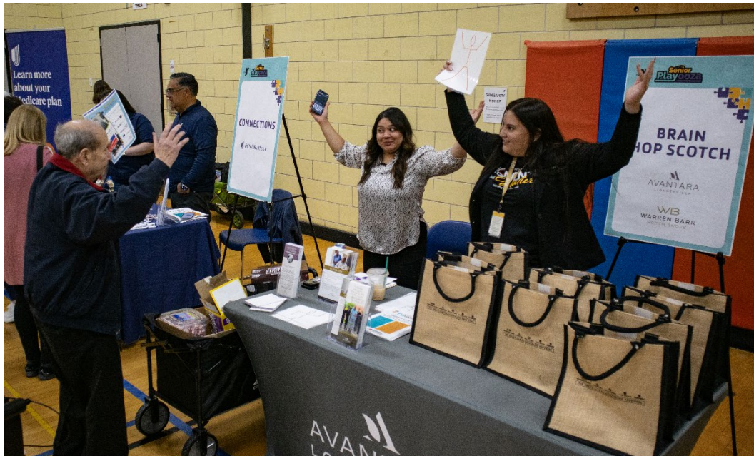
The North Suburban YMCA in Northbrook hosted their inaugural event, SeniorPLAYooza on Tuesday, May 12 th from 12-1pm. Avantara and Warren Barr hosted the 'Brain Hop Scotch' activity at the event.