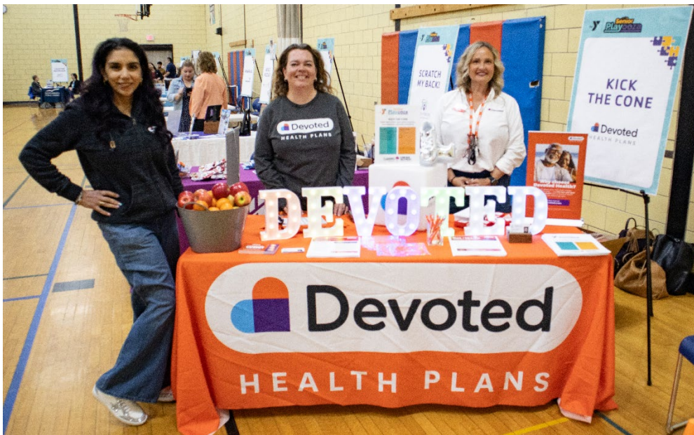
Devoted Health was one of the 30+ vendors who participated in the inaugural NSYMCA SeniorPLAYooza community event on May 13 th in Northbrook.