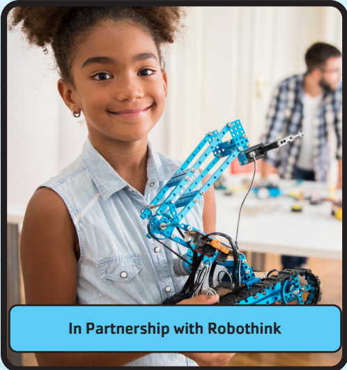
In Partnership with Robothink