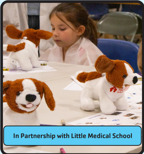
In Partnership with Little Medical School