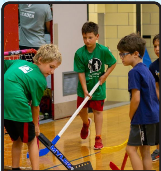
This program was supported by the Ruth Schultz Bright Days Fund