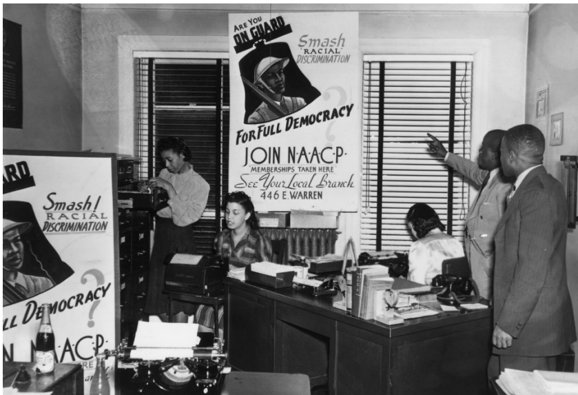
This photograph depicts a group of African American leaders joined together to form a new permanent civil rights organization, the National Association for the Advancement of Colored People (NAACP).