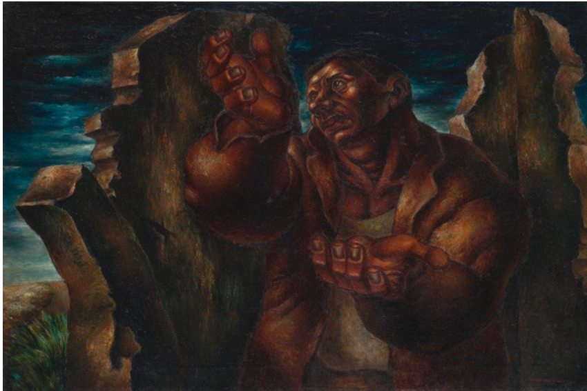
Titled, My Brother, artist Charles White depicts a man with outstretched hands emerging from a demolished structure, an art piece that hangs in the Gallery Gallery 262, at the Art Institute of Chicago.