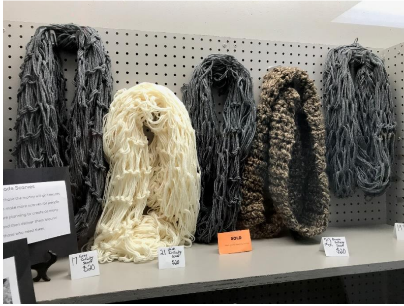
Photo 3: Handmade scarves by Laura Schonken are on display this month in the NSYMCA 3D Art Gallery.